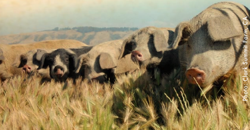
Photo: Clark Summit Farm, CA